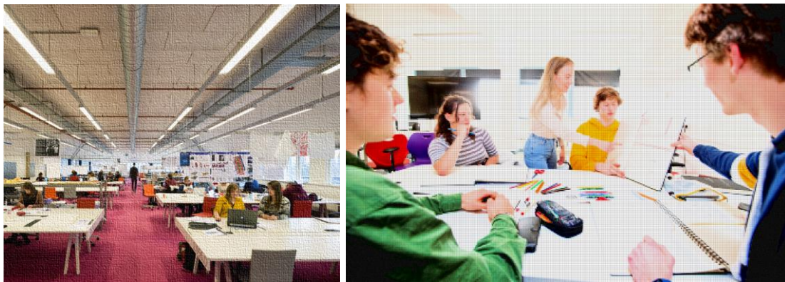
Figure 1. Typical TU Delft IDE/ABE design studio situation for undergraduate students

Teaching (physical) design skills in small studio groups of 10-25 engineering students has long been one of the main building blocks of the engineering curriculums at the TU Delft, in particular in the fields (and faculties) of Industrial Design Engineering (IDE) and Architecture & the Built Environment (ABE). The small group teaching approach in design education brings many advantages, such as community building between students (and mentors), student commitment, student engagement, and student visibility. The design studio is a stimulating and activating learning environment (Lawson & Dorst, 2009; Ghassan & Bohemia, 2015; Van Dooren, 2020) (Figure 1). It is the physical place where students get together many hours during the week to work on their individual and/or group assignments and projects. It is also the physical place where the students meet their tutors 1 for discussion, feedback, review, and assessment.