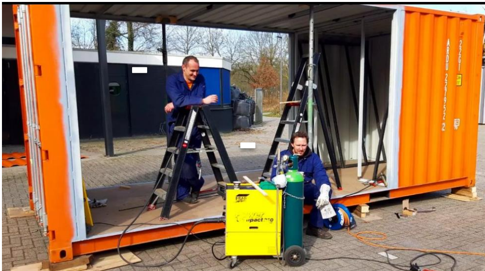
Fig. 3: Prototyping of the EduBOX