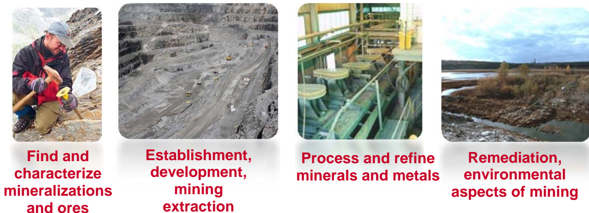
Figure 2. Stages in the life of mine.

The raw material chain can be subdivided into primary (exploration, extraction, mineral processing and metallurgy) and secondary (recycling and material substitution) resources. The main thematic content in this project is primary resources where the stages in the life of a mine are expressed in Figure 2. The exploration phase can be subdivided into reconnaissance and detailed exploration where each of these steps takes between one and five years. Hence often the establishment of a mine does not start until three to eight years after finding a mineralization. The development work, which often takes two to five years, concerns mining rights, financing, roads and transport systems, surface plants, shafts etc. The mining production, which is a process itself, needs to last more than 10-30 years in order to be economically sustainable. The final stage, which often takes one to ten years, is mine closure and restoring the mining area to an acceptable state of safety and environment. In each stage in the life of a mine it is important to simultaneously be aware of all the other stages in order to be an entrepreneurial and innovative engineer.