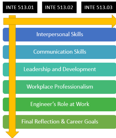
Figure 1. Overview of INTE 513 Pilot Module Streams.

Next, each module included reflective questions which asked students to apply the module content to their own work experience and reflect. For example, a module on Engineer's Role and Organization Value asked the students the following reflective question: